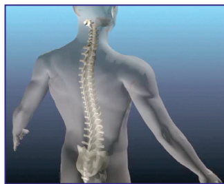
Body Viewer Training Program